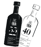
It's bottled and labeled